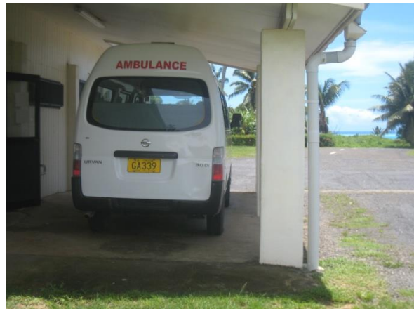
Above: delivering medical supplies